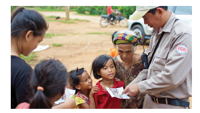
EOD technician delivering Explosive Ordnance Risk Education to community members in Dakrong District, Quang Tri Province

The presence of EO not only impacts the immediate safety of children and families, but also limits economic growth and employment opportunities, especially for members