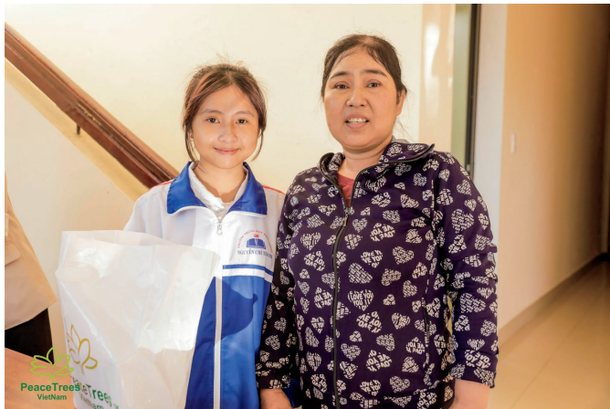
A scholarship recipient and her mother at a scholarship award ceremony in 2022