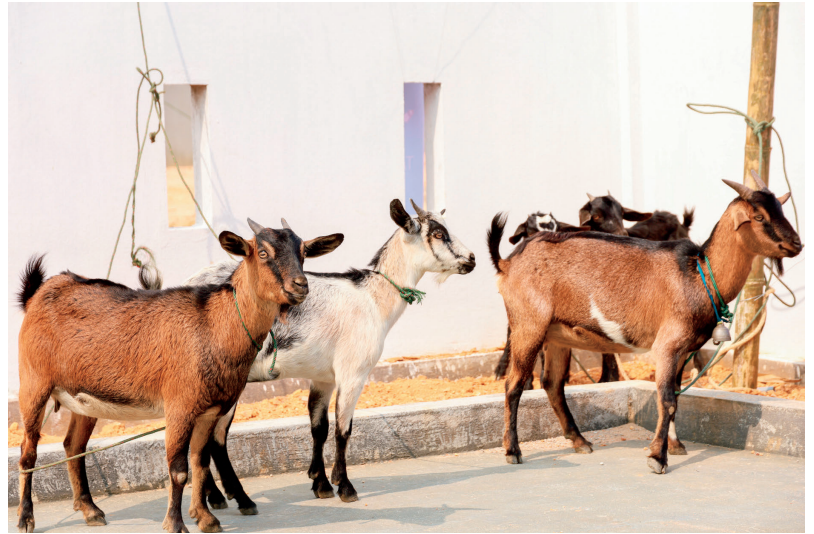
Goats being delivered to flood impacted families of Lia, Xy, and Huong Son Communes in Quảng Trị Province.

PeaceTrees is committed to supporting communities throughout central Vietnam as they begin to address challenges caused and exacerbated by climate change. Over the last year, PeaceTrees has continued building programs to support the families most impacted by the devastating storms and floods of 2020. In addition to the dwarf banana project in Ta Lao Village, PeaceTrees provided a water well in Cu Ty Village, started a goat husbandry program in Huong Hoa District, and helped move families into new homes through the Huong Viet Commune Resettlement Project. Working at the intersection of land and people, PeaceTrees aims to provide meaningful support to communities facing climate change related challenges so they can thrive now and into the future.