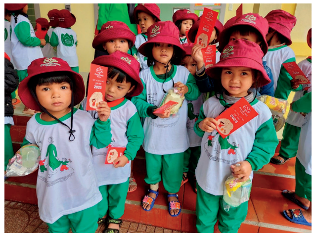
Students at the Cup Kindergarten during the official dedication ceremony

Williams International Friendship Fund and the USC School of Aviation Safety for helping make these schools possible! In 2023, more than 500 students will attend a PeaceTrees Kindergarten!