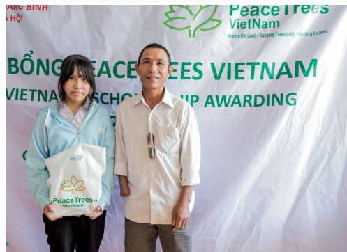
A scholarship recipient with her father at an award ceremony in Quảng Bình- Nov. 2022