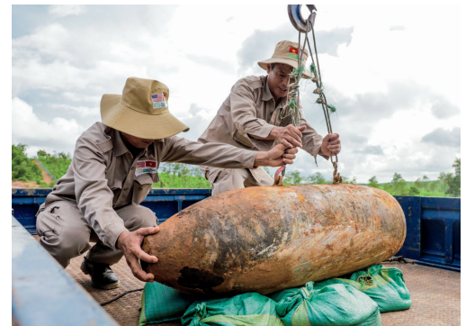
PeaceTrees Explosive Ordnance Disposal technicians safely removing a large bomb from a rubber plantation- Oct. 2022