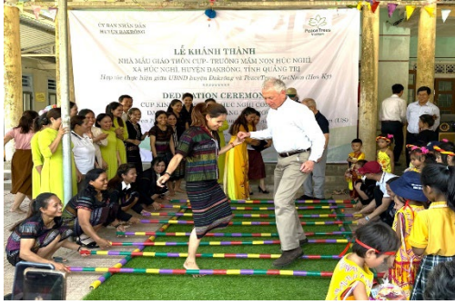
A kindergarten teacher and traveler playing games together at the Cup Kindergarten dedication ceremony- Quảng Trị Province