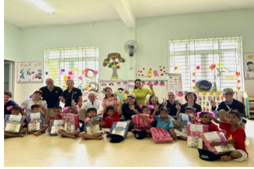
Students, school staff, and Citizen Diplomats in a Cup Kindergarten classroom- Quảng Trị Province