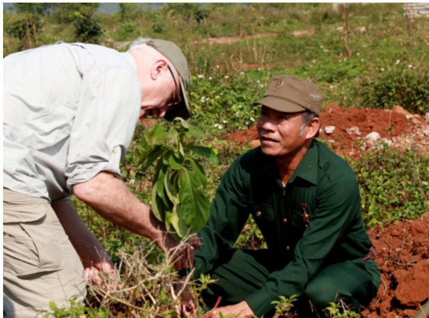
An American and Vietnamese Veteran planting a tree together in Quang Tri Province, Vietnam during a Citizen Diplomacy trip- 2012

This Memorial Day and every day PeaceTrees honors those who have served and sacrificed. In the spirit of this important day, we invite you to explore a virtual tour of the Vietnam War Wing at the Museum of American War Letters. This exhibit includes numerous war letters from Vietnam , many on public display for the first time ever, and other primary sources from wartime. However you choose to honor Memorial Day, we hope you find a moment for reflection, gratitude, and peace.