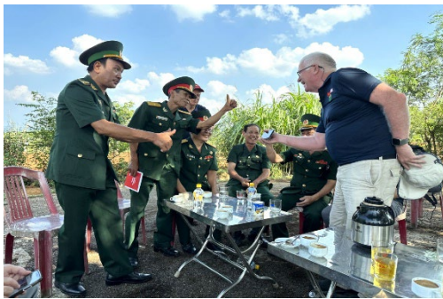
An American Veteran/Citizen Diplomat connecting with Vietnamese Veterans at Khe Sahn/Ta Con Combat Base- Quảng Trị Province