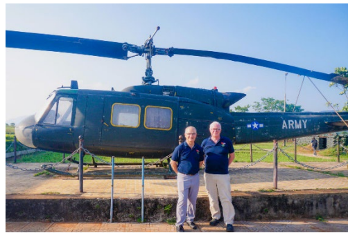
Citizen diplomat posing in front of an army helicopter at Khe Sahn/Ta Con Combat Base- Quảng Trị Province