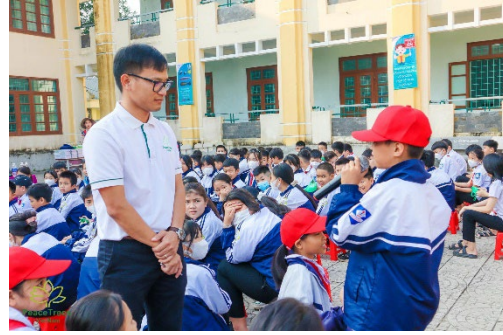
A Thuan Duc student participating in the EORE event- Quảng Bình Province