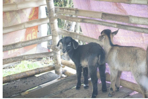
Baby goats at Xy commune - Quảng Trị Province