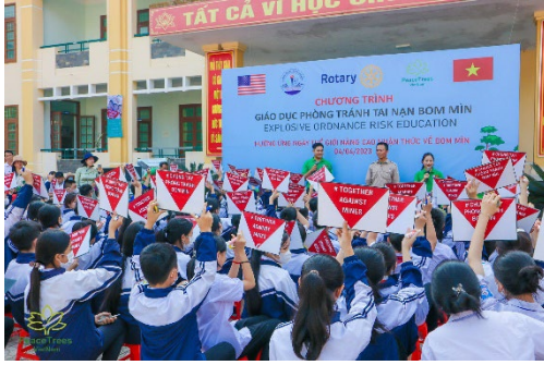
Students of Thuan Duc primary and secondary school learning what to do if they encounter an EO- Quảng Bình Province