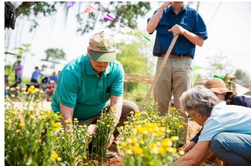
PeaceTrees Citizen Diplomats helping plant gardens at a local school