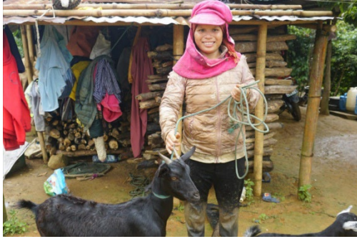
Goat breeding and husbandry project at Huong Son commune - Quảng Trị Province