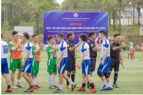
The PeaceTrees soccer team shaking hands with opponents after the friendly match- Quảng Tri Province