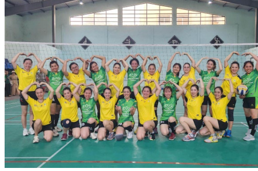
PeaceTrees deminers and program staff posing after a volleyball game- Quảng Tri Province