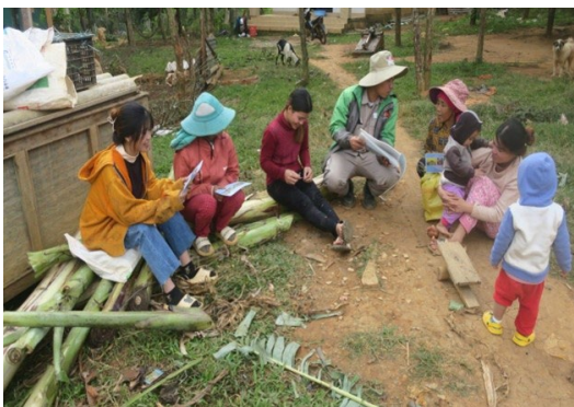
A PeaceTrees EOD technician delivering EORE to a group of residents in Tan Lien Commune- Quảng Trị Province