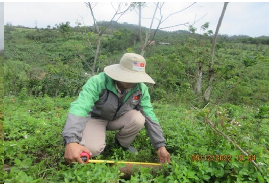
PeaceTrees EOD technician measuring the mortar after concluding it was safe to move- Tan Lien Commune, Quảng Trị Province