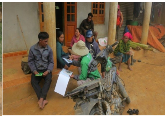
A PeaceTrees EOD technician delivering EORE to residents in Tan Lien Commune- Quảng Trị Province