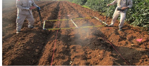
PeaceTrees EO teams clearing a field in Quảng Trị in March 2021

Following up on the work PeaceTrees does to return land to productive use, our teams visited land that had been cleared in March 2021 and were delighted to see healthy turmeric crops growing! Your support of PeaceTrees makes agriculture and economic development possible, and for that, we thank you!