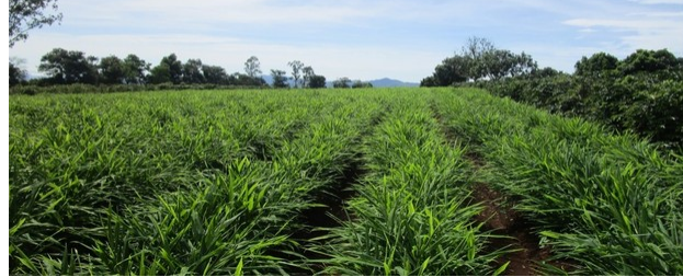
A photo of the same field taken in late August, now growing healthy turmeric crops