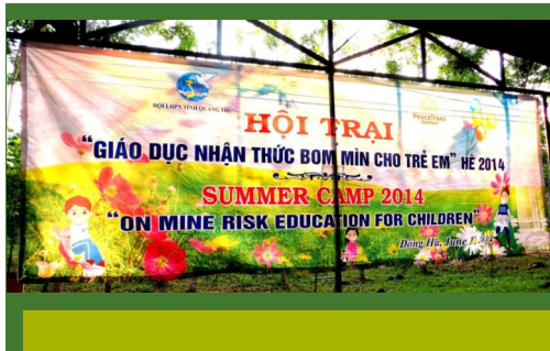
"The World Without UXO," by Le Ho Huu Nghia