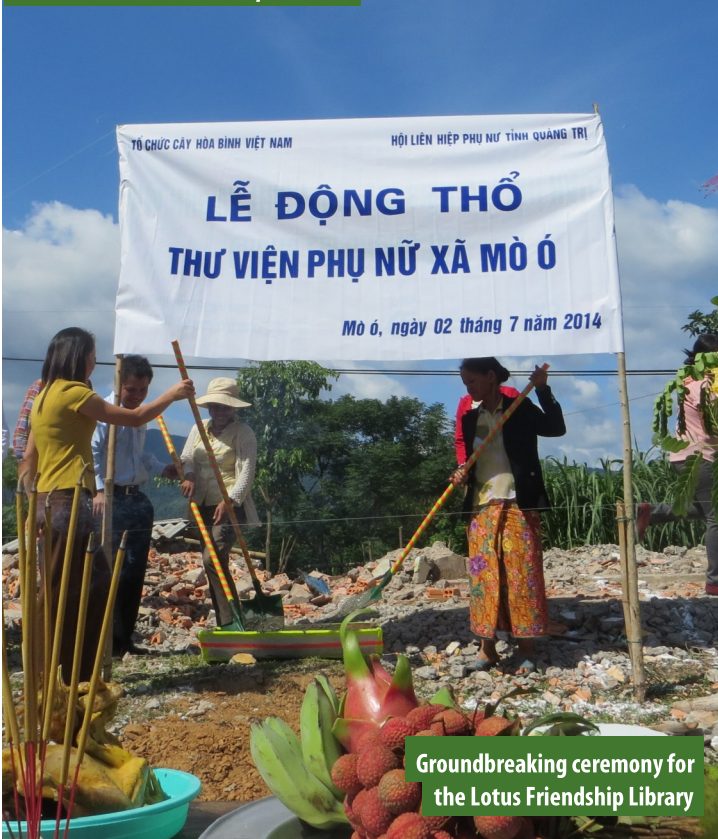
Groundbreaking ceremony for the Lotus Friendship Library