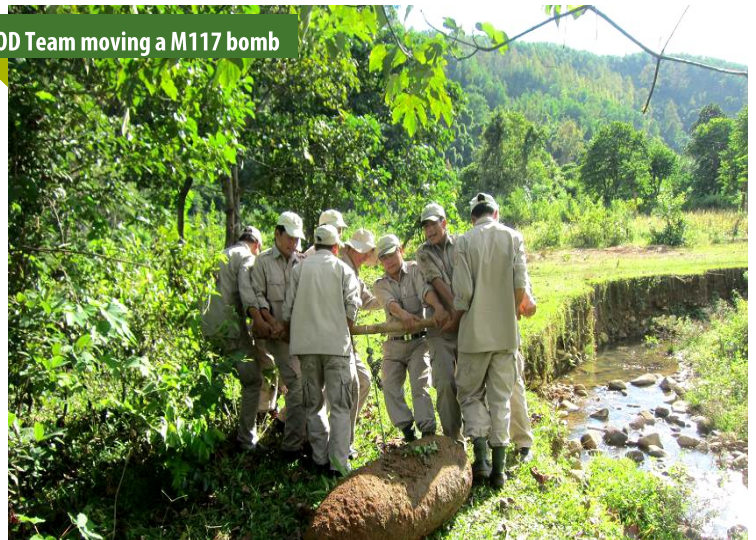
EOD Team moving a M117 bomb

Our two Explosive Ordnance Disposal (EOD) teams work throughout the year to ensure the safety of the people of Quang Tri Province. Not one team member has been injured by explosive material in the removal process.