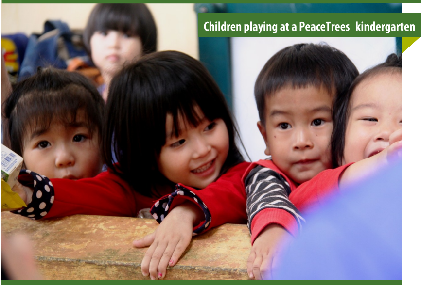
Children playing at a PeaceTrees kindergarten

Over the last 19 years, PeaceTrees Vietnam has built a 100-home village, 12 libraries, 9 kindergartens, 1 computer lab, and 2 community centers.