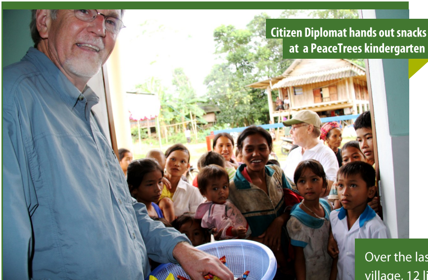
Citizen Diplomat hands out snacks at a PeaceTrees kindergarten