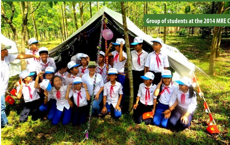
Group of students at the 2014 MRE Camp

The cornerstone of PeaceTrees Vietnam's MRE program is the Danaan Parry Landmine Education Center, the only center of its kind in Vietnam. With support from the U.S. Department of State, we held a mine risk education camp in honor of International Children's Day in June this year. More than 300 students attended to learn about the dangers of UXO and how to remain safe when encountering them. The camp featured a poster and essay contest, which encouraged at-risk students to think deeply and creatively about mine risk issues that affect their daily lives.