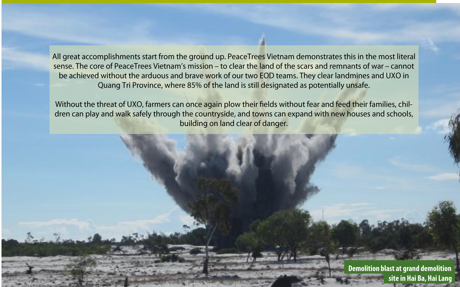
Demolition blast at grand demolition site in Hai Ba, Hai Lang

Without the threat of UXO, farmers can once again plow their fields without fear and feed their families, children can play and walk safely through the countryside, and towns can expand with new houses and schools, building on land clear of danger.