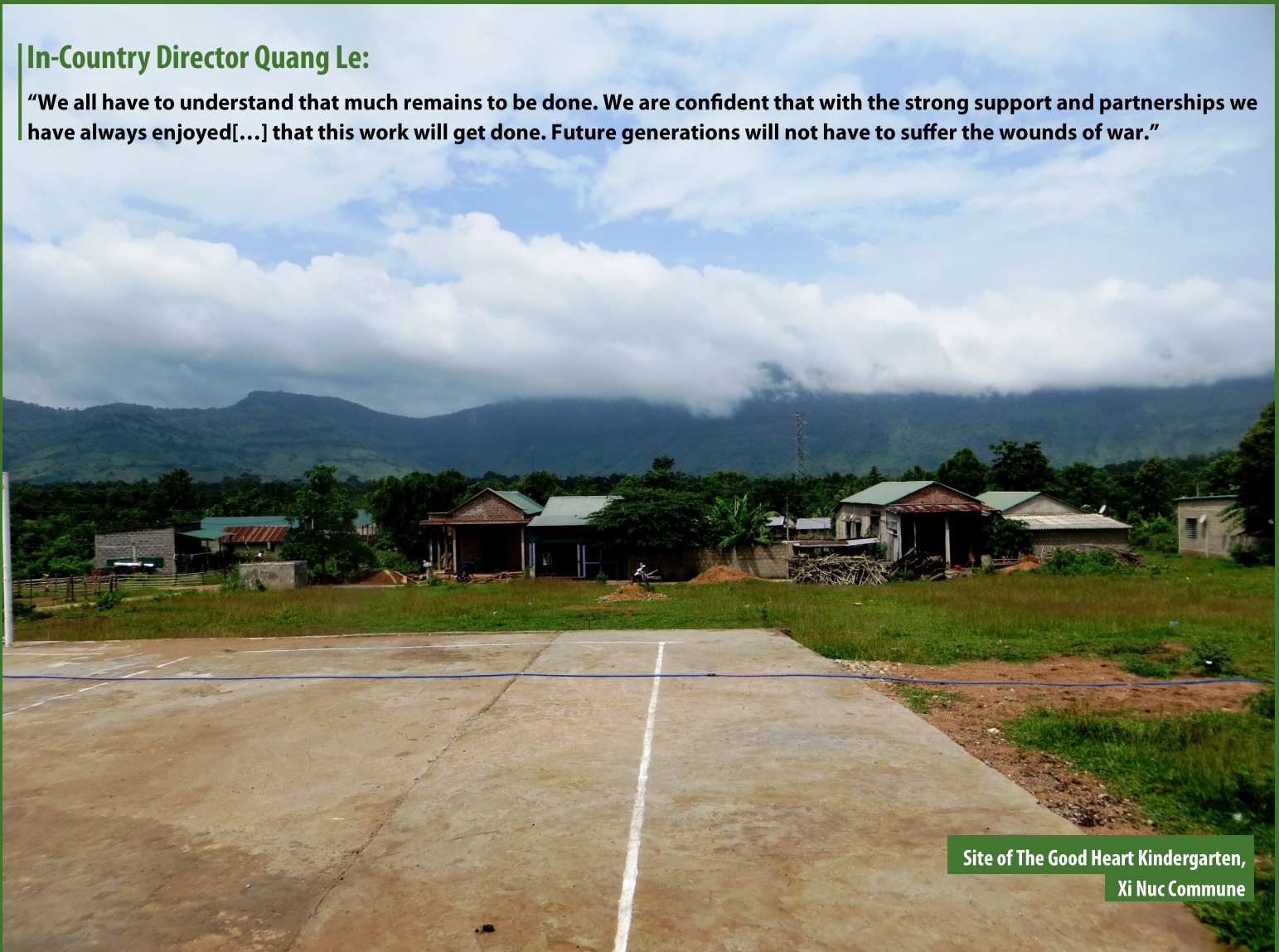
Site of The Good Heart Kindergarten, Xi Nuc Commune

"We all have to understand that much remains to be done. We are confident that with the strong support and partnerships we have always enjoyed[...] that this work will get done. Future generations will not have to suffer the wounds of war."