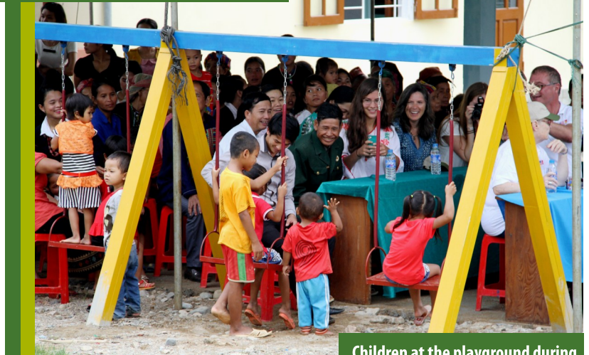
Children at the playground during the Sunflower Kindergarten dedication

“I have unfinished business. It is my most ardent wish to see this library built in my lifetime.”