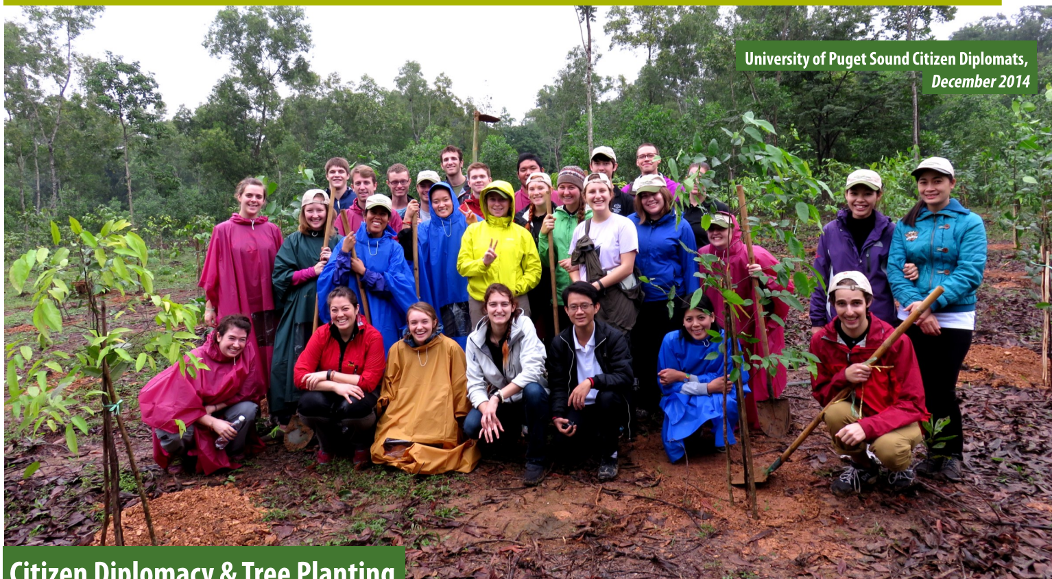
University of Puget Sound Citizen Diplomats, December 2014