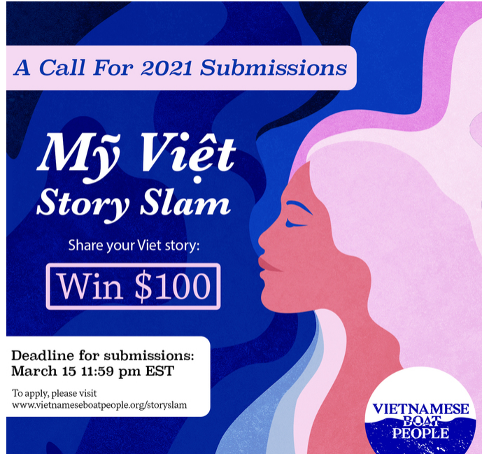
Click the photo above to learn more about submitting a story for VBP's second annual story slam

Vietnamese Boat People are also hosting their second annual Story Slam. This year's theme is "2020: A Year Unlike Any Other." Individuals 18 and older, are invited to submit personal stories of their Vietnamese American perspective on how the events of 2020 have impacted them as Asian Americans.