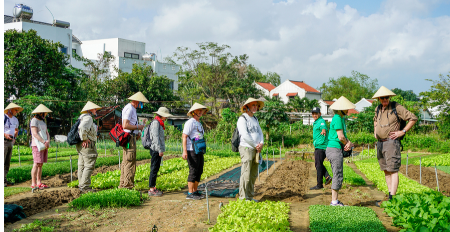
Citizen diplomacy travelers on an eco-tour in Hoi An, January 2020

Join the PeaceTrees Community to learn more about our work and connect with other travelers and supporters! Click here and request to join.