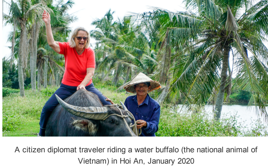
A citizen diplomat traveler riding a water buffalo (the national animal of Vietnam) in Hoi An, January 2020

This newsletter contains highlights from the end of 2020, important project updates, and opportunities to connect with the PeaceTrees community. This past year would not have been possible without your support. We are excited to walk and work alongside you throughout the new year.