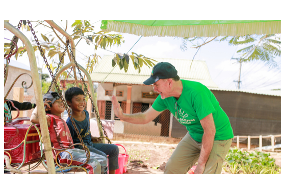
Citizen diplomacy traveler and children at the Cheerful Children Kindergarten dedication, January 2020

Email natalie@peacetreesvietnam.org to share your story about traveling with PeaceTrees.