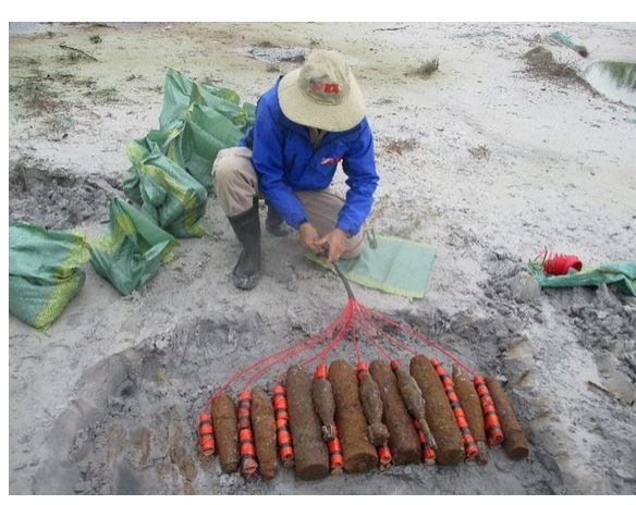
A PeaceTrees EOD technician preparing to safely destroy ordnance (December 2020)

In the final three months of last year, PeaceTrees was able to clear 763,303 square meters of land! This accomplishment means that 6,690 people are now safe to walk, play, and work on their land without fear.