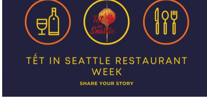
Click the photo above to visit the Facebook event page to learn more about the Tết in Seattle Restaurant Week