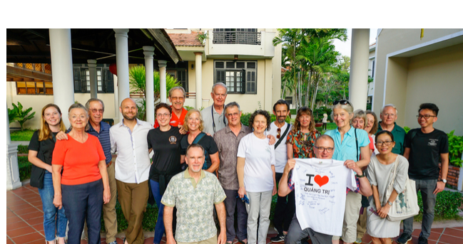
Citizen diplomats and PeaceTrees staff pose for a group photo in Hoi An, January 2020