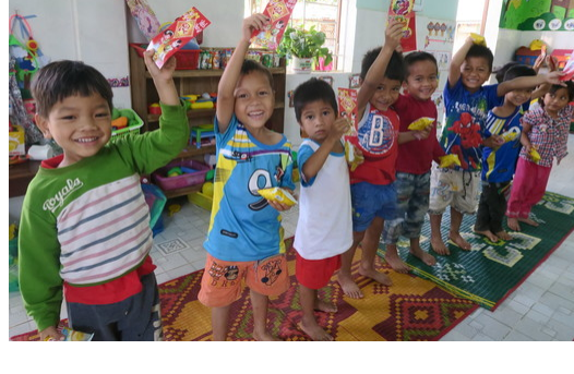
Students at a PeaceTrees kindergarten celebrate Tết by receiving lucky envelopes with treats inside (2020)

Tết in Seattle is also promoting a restaurant week that celebrates Vietnamese cuisine! Participating restaurants will be offering various discounts from February 12th-22nd. We encourage you to order takeout from a participating restaurant to celebrate The Lunar New Year and support our local businesses.