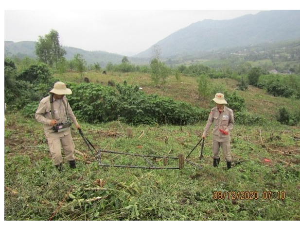
A pair of PeaceTrees EOD technicians searching for unexploded ordnance (December 2020)