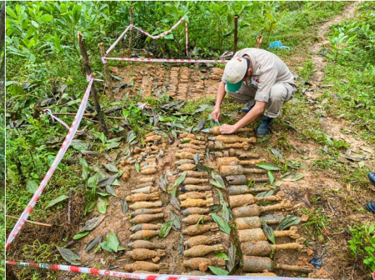
A PeaceTrees EOD technician measuring some of the bombs after they were safely removed from the crater-Quảng Bình Province