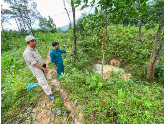
A local farmer pointing out the bomb crater where EO items have been unsafely stored- Quảng Bình Province

store it in so that they can continue farming which increases the risk of an EO accident. This story is another example of the continued need for clearance work and Explosive Ordnance Risk Education (EORE) in central Vietnam.