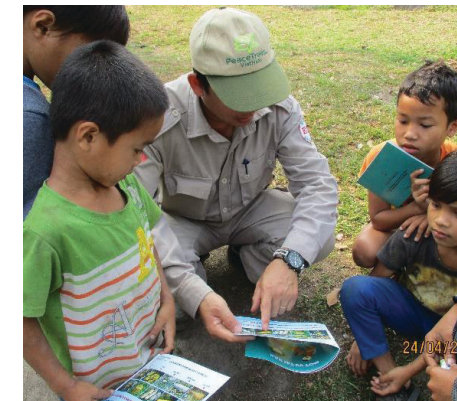
Mine Risk Education Session being held in April 2018 at an EOD call out location