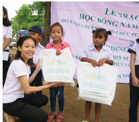
Scholarship ceremony in DaKrong District, August 2018