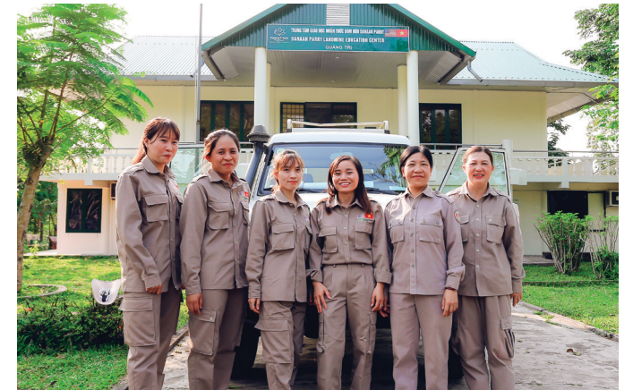
PeaceTrees Explosive Ordnance Disposal Technicians

We hired, trained and certified sixteen new deminers. PeaceTrees deminers continue to lead in experience and productivity. In total in 2018, 6,378 explosive remnants of war were found and destroyed, including 10 large bombs , one weighing more than 2,000 lbs. The safe removal and destruction of explosives released 314 acres of land back to communities in Huong Hoa and Da Krong districts. More than 75% of this land will be used for farming, and the remaining 24% is intended for residential areas and development.