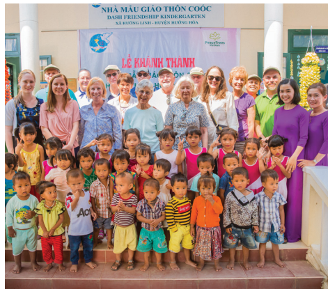
Dash Friendship Kindergarten built 2018, dedicated March 2019