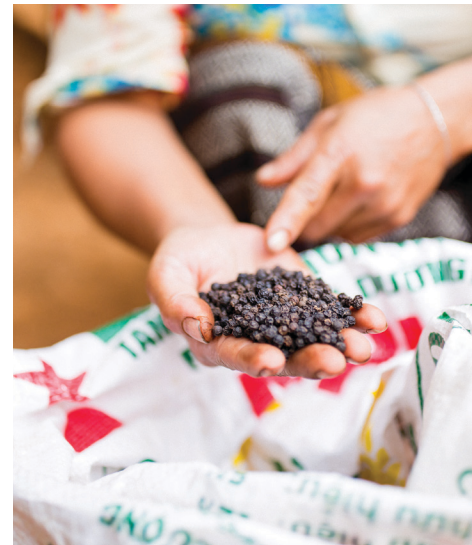
Black pepper harvest

In the spring of 2018, after three years of cultivation, pepper farmers harvested their first mature black pepper crop. Although small, this first harvest marked an important milestone in the project. Project partners purchased the farmers' black pepper at market prices, providing our farmers with a substantial portion of their annual income.