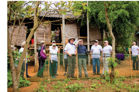
Healthful Gardens for Healthy Children Project in Huong Tan commune

Women's empowerment and self-sufficiency is at the core of PeaceTrees Vietnam's work. The Healthful Gardens for Healthy Children project, implemented in partnership with the Quang Tri Province Women's Union, empowers women in ethnic minority communities to provide ample nutrition for their families and earn additional income from their gardens. By training women in post-conflict communities to become self-sufficient experts in vegetable farming practices, this project helps to reduce the rate of malnutrition that impacts one quarter of children country-wide. There are now 392 women participating in this program. In 2018 all women participants have successfully planted gardens and harvested crops, and more than 10% earned income by selling vegetables at the market. In 2019 we will continue to expand and support this project with a goal of fostering food security in these communities.