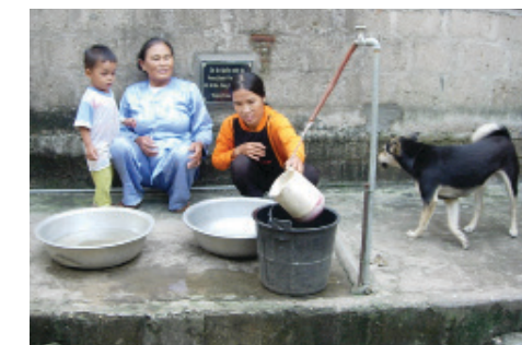
Xa Lang Village well beneficiaries

Providing access to clean water: In 2018 a well was drilled Xa Lang village, Dakong commune which will ensure that 15 ethnic minority families have access to reliable clean water . Previously, the families collected water from streams for household use, but during flooding or in dry seasons, this source of water was either insufficient or not safe for use. Having access to clean water and sanitation is proven to substantially improve the health of communities and also to support the economic empowerment of women in the communities.