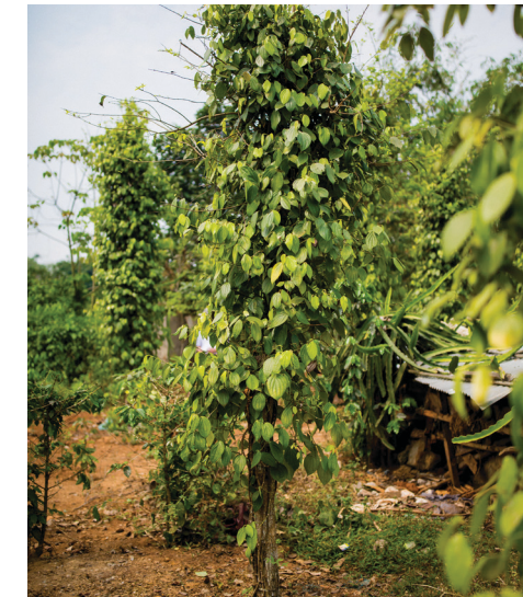
Pepper plantation in Huong Tan commune