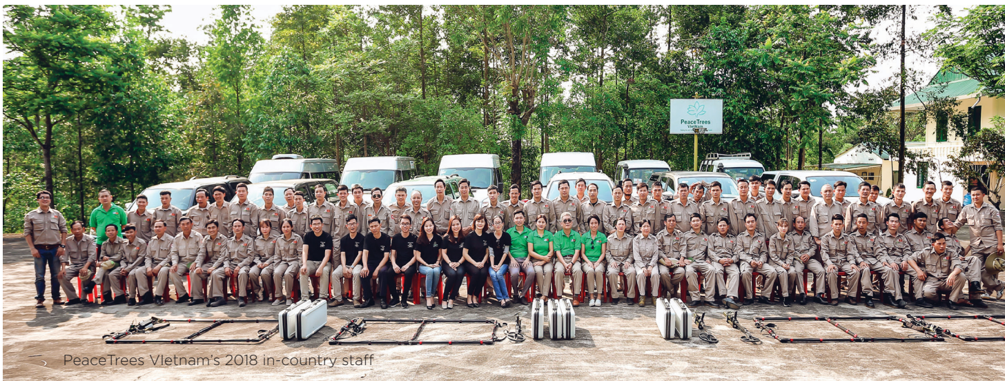
PeaceTrees Vietnam's 2018 in-country staff