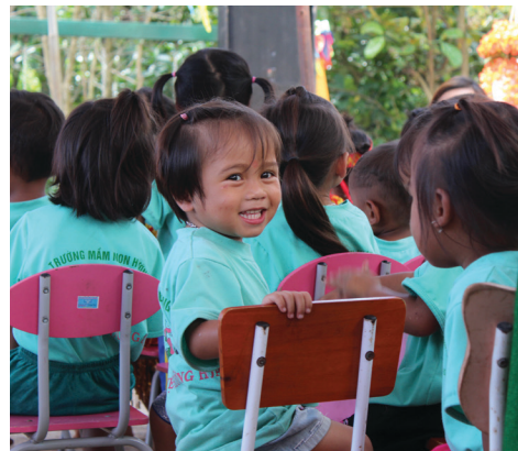
Ruong Kindergarten Dedication, September 2018