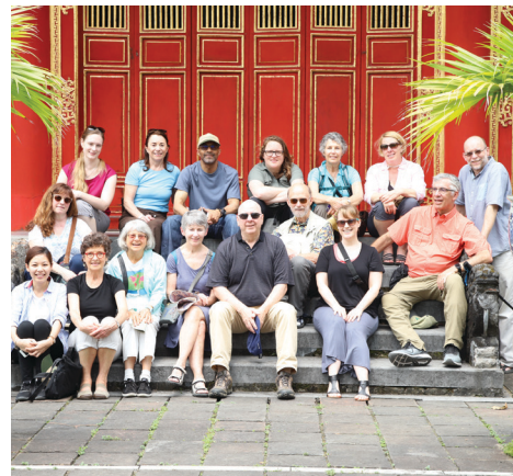
March 2018 CDT Group at the Hue Citadel