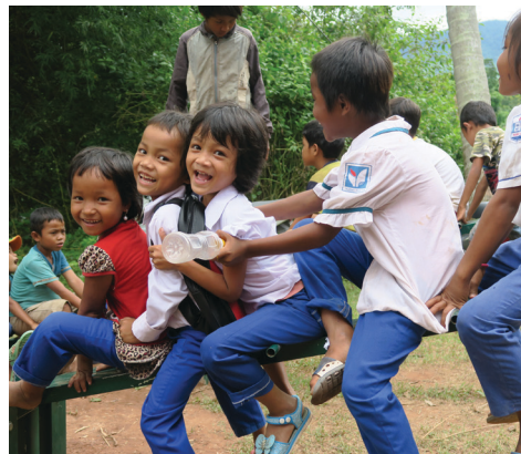
Ra Man Kindergarten dedication, September 2018