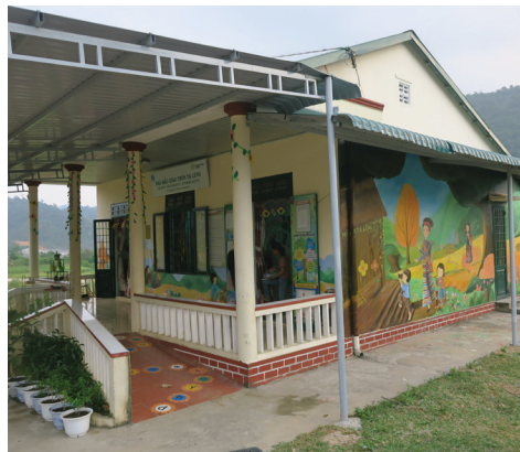
Arthur Bustamante Kindergarten Ta Leng Village dedicated March 2018

In total, PeaceTrees has built 15 kindergartens through the generous support of our community here in the United States and our partnerships in Vietnam. These kindergartens allow approximately 525 children to attend school each year. In 2018, 365 scholarships were awarded to mine accident affected and ethnic minority children with financial need!