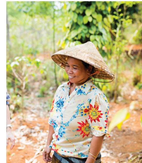
Project participant in Huong Tan commune