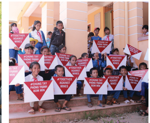
Mine Risk Education camp activities in October 2018

PeaceTrees continues to prioritize clearance requests for social welfare and community development purposes. PeaceTrees cleared 39 such sites for this purpose in 2018, which made land safe for 9 future schools, 7 public and social welfare construction projects (including markets, community houses and health centers), 17 future roads, 4 agricultural areas, and 2 residential areas.