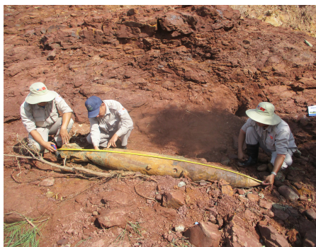
Deminers responding to unearthed 500 lbs bomb in Quảng Trị, November 2020