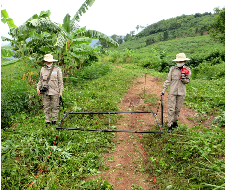
Deminers sponsored by the 25th Anniversary Clearance Project cleared 10,560 m 2 in October 2020 to allow for the construction of roads to cultivated areas in A Doi commune, Hương Hoa District

We continued to emphasize Explosive Risk Ordnance Education (EORE). In 2020 alone 19,782 people received EORE. Due to COVID-19 this year, PeaceTrees facilitated a virtual EORE artwork competition for four schools in Hương Hóa and Đa Krông Districts to promote knowledge on how to stay safe. 1,369 students participated in a two-week competition that involved mural paintings, poster making, and the creation of educational videos on the risks of UXO. PeaceTrees' EORE activities have become one of the most interesting and meaningful extra-curricular activities offered to students in these districts.