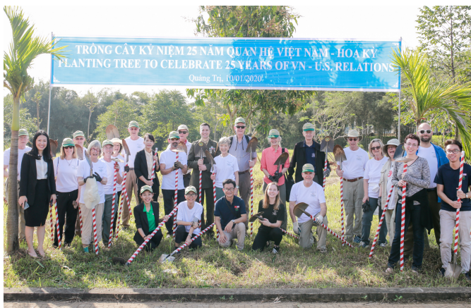
Tree planting ceremony alongside the Ben Hai river, January 2020