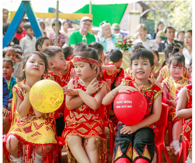
Cheerful Children Kindergarten dedication, January 2020

In January 2020, PeaceTrees dedicated the Cheerful Children Kindergarten in Làng Vây Village, Quảng Trị Province , alongside project sponsors and citizen diplomats. Construction of three new schools also began in 2020. The Prin Thanh Village Kindergarten and the Cua Village Kindergarten were both completed during the year and welcomed children in the 2020/21 school year. The Ooc Village Kindergarten in Quảng Bình province is expected to be completed in Summer 2021. Alongside project sponsors, PeaceTrees has funded the construction of 19 kindergarten classrooms which help to facilitate the educational goals of youth across central Vietnam. To date, 3,589 children have attended kindergarten in a classroom funded by PeaceTrees.