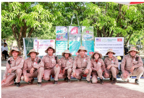
Quảng Bình demining team, December 22, 2020

October brought devastating and torrential rains to central Vietnam, resulting in flooding and landslides that impacted over one million people. PeaceTrees Explosive Ordnance Disposal (EOD) teams, experienced in providing emergency support in rural and difficult-to-reach areas, provided emergency aid during and immediately after the crisis. In addition to providing the safe clearance of unexploded ordnance exposed by the flood, PeaceTrees has worked to repair and rebuild schools and libraries damaged in the storms as well as to provide aid to impacted families.