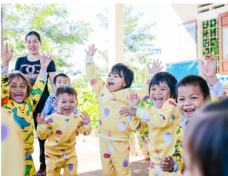
Kindergarteners receiving holiday gifts, December 2020