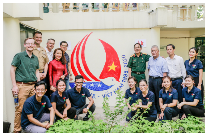
25th anniversary commemorative mural at the Danaan Parry Landmine Education Center, July 2020