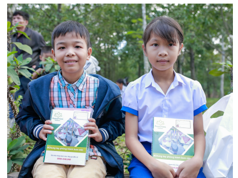
Scholarship recipients at the Danaan Parry Landmine Education Center, October 22, 2020