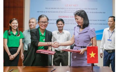
Signing of the 25th anniversary clearance project memorandum, July 20, 2020