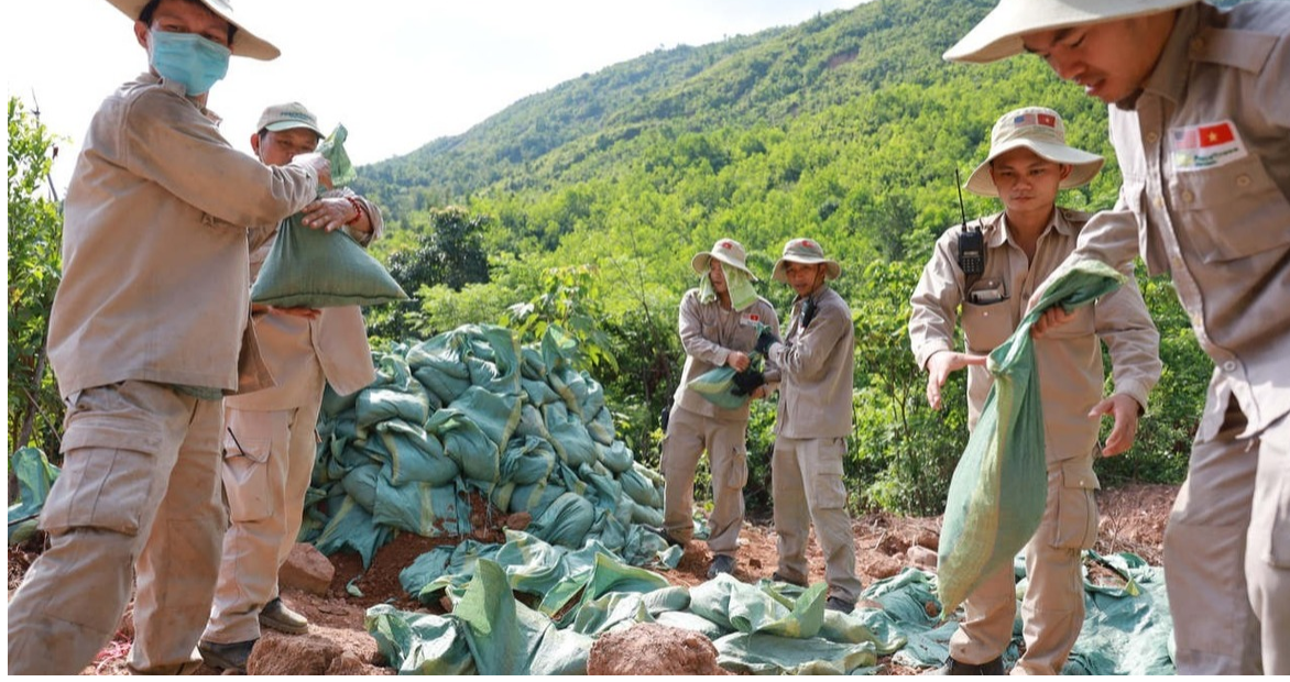
PeaceTrees deminers lining up sand bags at the demolition site to minimize the damage of the planned explosion- June 2, 2021