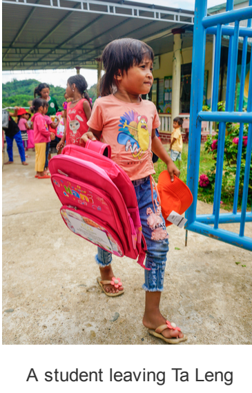
A student leaving Ta Leng Kindergarten for the summer with their new backpack and sun hat!

Although some of our kindergartens had to close early this school year due to a rise in COVID-19 cases, our in-country staff was still able to visit several kindergartens and deliver end of year gifts to the students! We know the last year and a half has been difficult for students, families, and educators and we hope that this fall we can learn together and in-person once again!