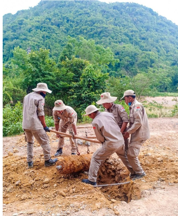
The PeaceTrees demining team removing the large bomb from the rocky hillside

The second large bomb was reported by residents of Cu Bai village and was located just 3 feet below a main road that residents use every day. Our teams evaluated that this bomb was also safe to move and moved it to the same storage site. PeaceTrees is so grateful for the local communities we work with, they help identify explosive remnants of war and alert our teams to their whereabouts!