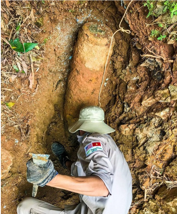
PeaceTrees explosive ordnance technician uncovering the bomb from the rocky hillside

On May 26, PeaceTrees responded to local calls about two large bombs located in Huong Hoa and Dakrong Districts in Quang Tri Province. The first 500 lb. bomb was located on a rocky hill buried deep in layers of soil, once technicians concluded that it was safe to move, the team spent 5 hours moving the bomb and safely transported it to a secure storage site where it will wait to be destroyed at a later date.