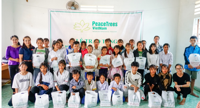
2019-2020 school year scholarship recipients, August 2019