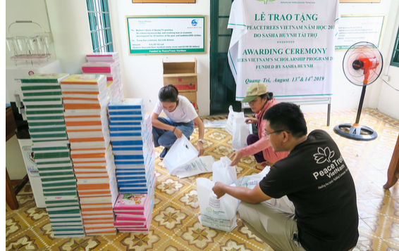
PeaceTrees team preparing scholarship packets, August 2019

These students have demonstrated financial need, strong studying habits, were directly impacted by an unexploded ordnance accident, and/or are ethnic minority children and young adults. They now have more tools and support to help break out of the larger cycle of poverty. Today we celebrate our young scholars and wish them radiant futures!