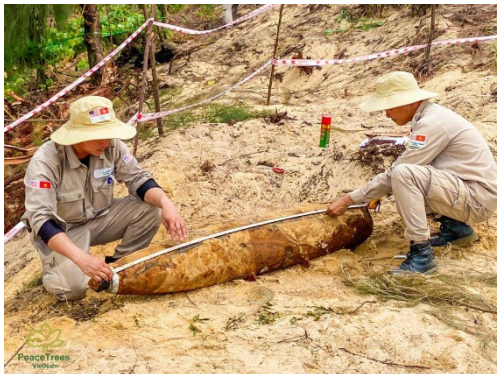
PeaceTrees EOD technicians take measurements of the bomb found buried in Quảng Bình Province

The Quảng Bình Provincial Military Command requested assistance, and PeaceTrees Vietnam quickly responded by sending a team to remove the bomb. After the Explosive Ordnance Disposal (EOD) technicians carefully examined the bomb, they decided that it was safe to move, and removed it from the site to be destroyed.