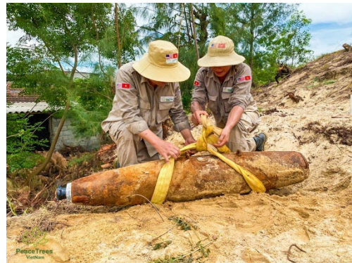
A team of PeaceTrees EOD technicians using moving straps to safely remove the large bomb - Quảng Bình Province