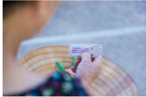
Keychains with hotline numbers for reporting suspected ordnance being distributed in Cam Nghĩa for the Explosive Ordnance risk Education event