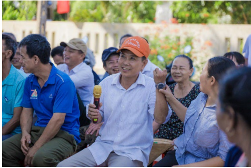
Cam Nghĩa community members participating in Explosive Ordnance Risk Education

Participants engaged in informative sessions about the dangers of EO and learned how to best avoid accidents. With support from Boeing Southeast Asia, PeaceTrees will continue expanding EORE and community outreach throughout Quảng Trị Province.