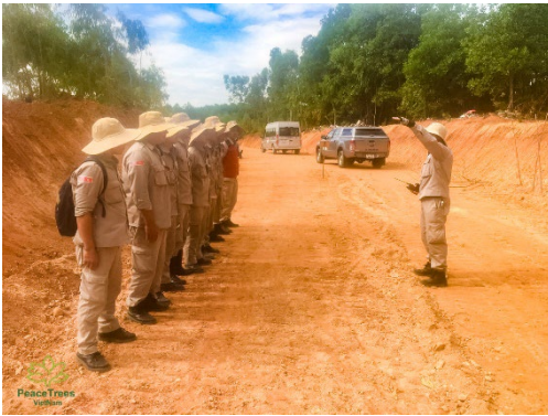
PeaceTrees EOD technicians receive direction from a team leader in Quảng Bình Province