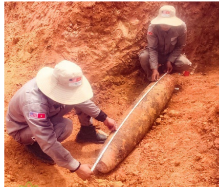
PeaceTrees EOD technicians take measurements of the bomb found buried in Quảng Bình Province