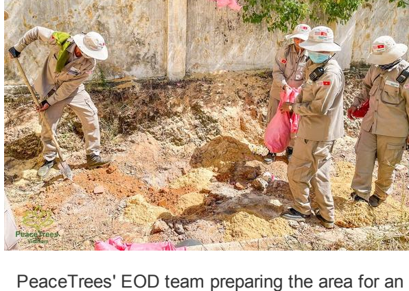
PeaceTrees' EOD team preparing the area for an on-site demolition