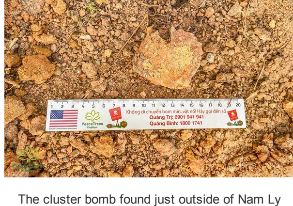
The cluster bomb found just outside of Nam Ly middle school on July 19th

On the morning of July 19th, PeaceTrees' EOD teams received a call about a suspected bomb discovered by construction crews just outside the Nam Ly middle school in Quang Binh Province. PeaceTrees teams confirmed that the suspected item was a cluster bomb and was not safe to move. They then conducted a safe, on-site demolition after evacuating the school and surrounding areas. Now that this cluster bomb has been safely destroyed, the 1,067 students and 43 teachers that attend the school can study, play, and teach in safety!