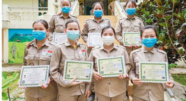
7 of PeaceTrees' female EOD technicians after achieving their Level 2 and 3 IMAS Certification