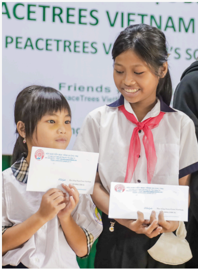
Caption: Two young students receiving scholarships from PeaceTrees Vietnam at a scholarship ceremony in Quảng Trị Province.

Since 1995, PTVN has built over 23 kindergartens for communities throughout central Vietnam. During the 2023/2024 school year alone, over 450 kindergarteners were enrolled in PTVN kindergartens and over 650 students participated in our hot lunch program. In 2023, we also began the construction of Thanh Central Kindergarten in Hướng Hóa District, Quảng Trị Province. The school was completed in 2024 and will serve 62 kindergarteners and their teachers each year.