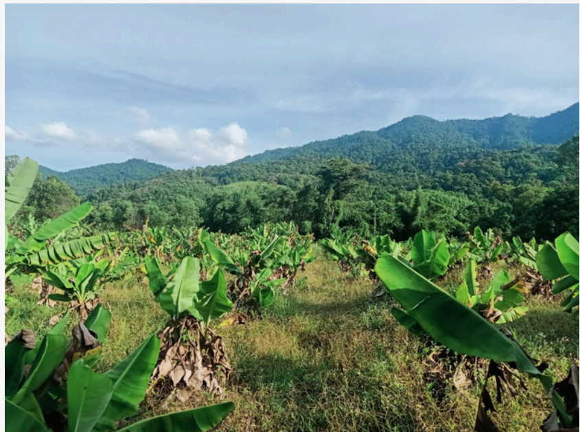
Caption: A banana plantation grown from original seedlings provided to households participating in our Indigenous Banana Planting Project, which is designed to support ethnic minority communities in Đa Kông District's Tà Long Commune.

In 2023, over 40 ethnic minority households in Quảng Trị Province participated in livelihood projects with PTVN. From indigenous banana plantations to pig farming, program participants received the technical training and resources to begin their new livelihood ventures. Our Revolving Goat Project grew and 15 new households are now participating thanks to the baby goats they received from the project's original households.