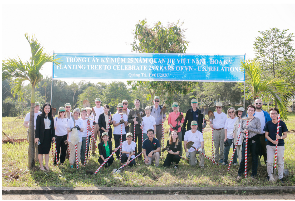
Citizen Diplomats planting trees along the Ben Hai River, the former DMZ, January 10, 2020