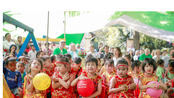
Children waiting to perform at the Cheerful Children Kindergarten dedication - January 2020