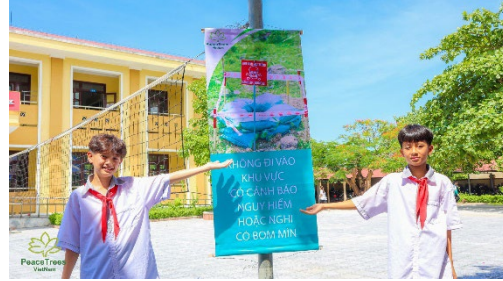
Two students in Bó Trạch District showcase materials for the Explosive Ordnance risk Education event