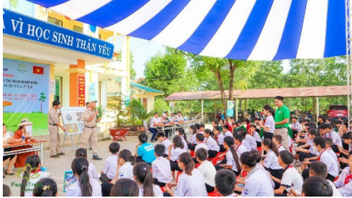
Students receiving Explosive Ordnance Risk Education in Bó Trạch District