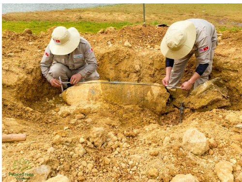
PeaceTrees EOD technicians take measurements of the bomb found buried in Quảng Bình Province

It has been nearly fifty years since the war ended, and leftover remnants of war still pose a threat to people's lives and livelihoods. PeaceTrees is grateful to our organizational partners and the U.S. Department of State for supporting our work in Quảng Trị and Quảng Bình!