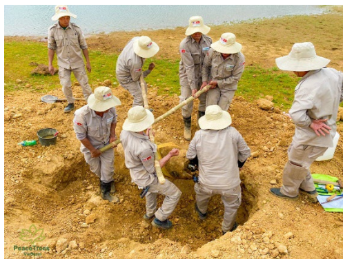
A team of PeaceTrees EOD technicians using bamboo poles to safely remove the large bomb - Quảng Bình Province