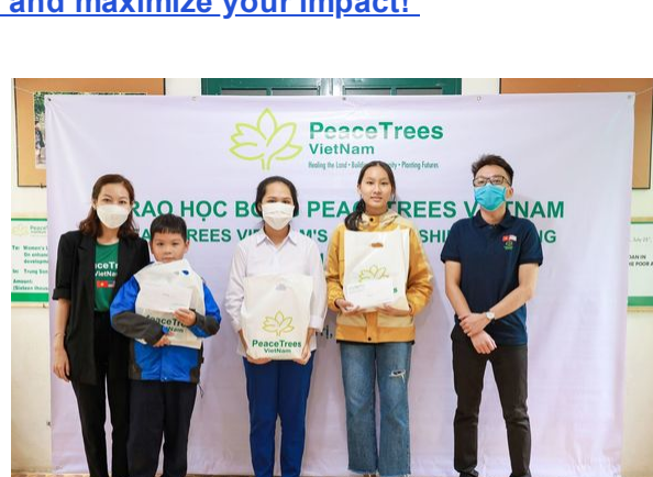
Quảng Trị students received PeaceTrees scholarships in early November