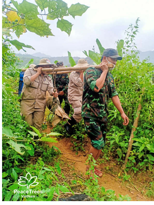
A PeaceTrees EOD team using bamboo poles to transport the heavy bomb

Early November brought heavy rains to central Vietnam, unearthing several dangerous bombs. On November 8th, PeaceTrees teams were notified by the Quảng Trị Mine Action Center about two large bombs discovered in Huong Hoa District. PeaceTrees EOD technicians spent five challenging hours removing a 500 lb. bomb and transported it to be safely destroyed. The second bomb, weighing closer to 800 lbs., was deemed too dangerous to move so it was flagged and will be destroyed on site as soon as it is safe to do so.