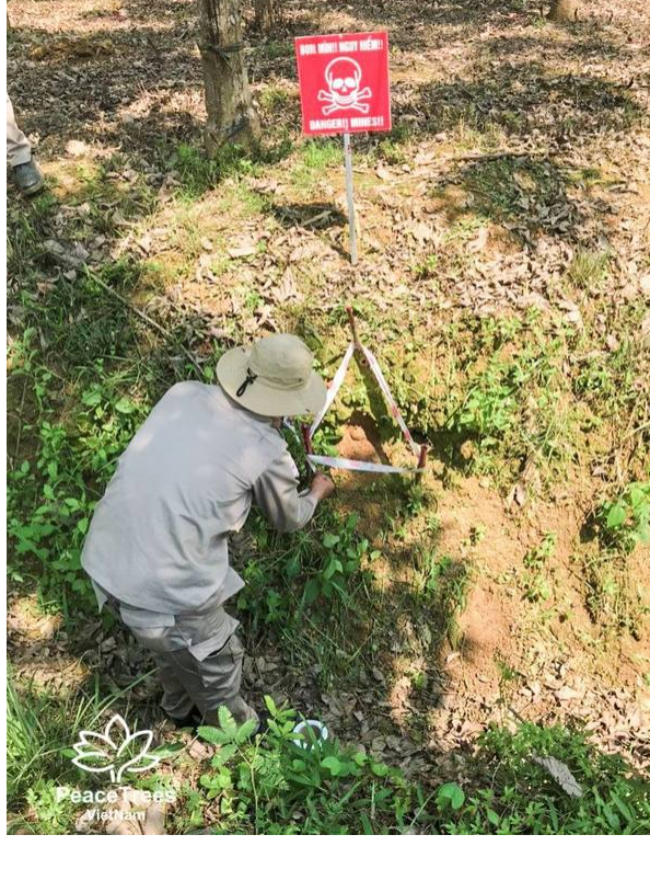
A PeaceTrees EOD technician marks the location of a suspected explosive ordnance