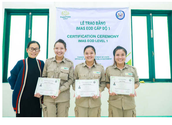
Three of the EOD technicians receiving their IMAS Level 1 Certificates on November 5th

On November 5th, 41 more members of PeaceTrees Explosive Ordnance Disposal teams received International Mine Action Standard (IMAS) Level 1 certification. These recipients have all completed intensive training and have spent nearly one year in the field working alongside more seasoned technicians. PeaceTrees is deeply grateful for the continued commitment and dedication all our EOD technicians display on the job!