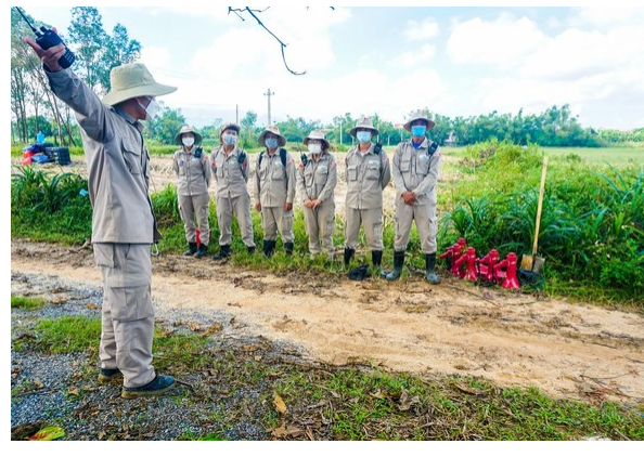
IMAS Level 1 field training