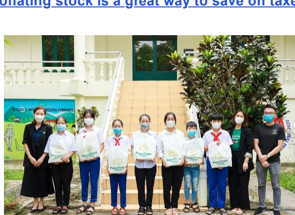
PeaceTrees scholarship recipients in front of the Danaan Parry Landmine Education Center

#StockMonday is also around the corner on November 29th, the Monday after Thanksgiving. This day provides an opportunity to highlight the benefits and ease of giving stock to non-profits. Donating stock is a great way to save on taxes and maximize your impact!