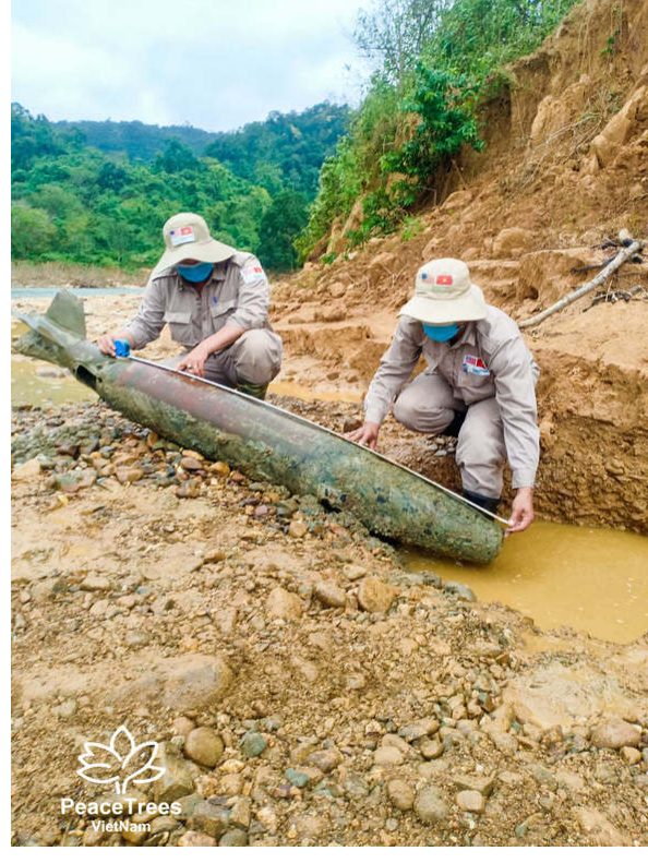
PeaceTrees EOD technicians measuring the 500 lb. bomb