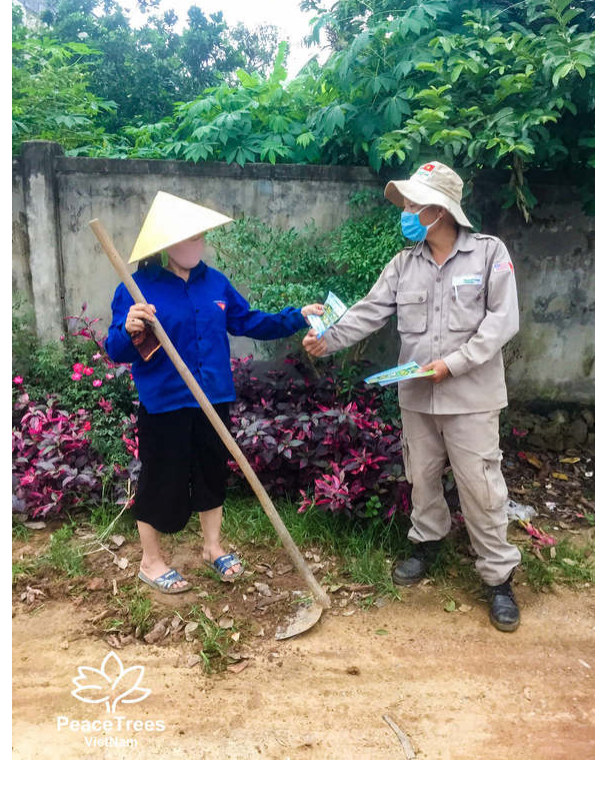
A PeaceTrees EOD technician provides a Quảng Bình resident with information about what to do if she encounters a suspected bomb or mine

At the end of October, PeaceTrees Vietnam technicians finished clearing their first Confirmed Hazardous Area (CHA) in Quảng Bình! Teams have been working on this area since March and have cleared 65,455 square meters of land (the equivalent of about 12 football fields) and safely destroyed 34 items of explosive ordnance. PeaceTrees' Quảng Bình teams are currently clearing five other CHAs in the same commune, while also providing Explosive Ordnance Risk Education (EORE) to help communities understand what to do if they encounter a bomb or mine.