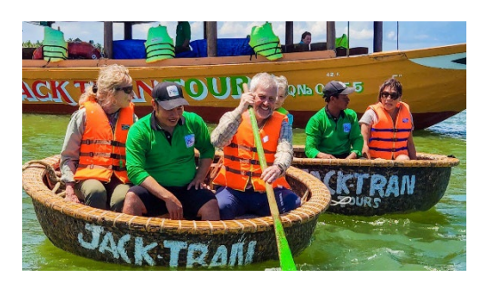
Citizen Diplomats ride traditional boats outside of Hoi An on an all-day eco-tour

visits to cultural sites, and meetings with local officials made this a culturally rich and meaningful journey! If you are interested in joining PeaceTrees on a Citizen Diplomacy trip in 2024, please visit our website.