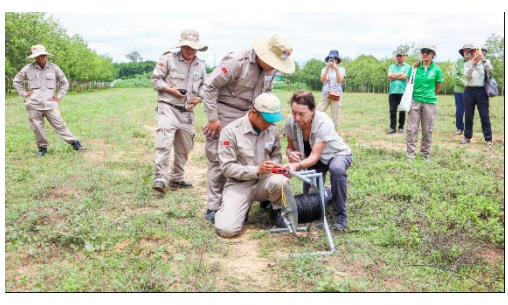
A field visit with PeaceTrees' demining teams in Dong Ha