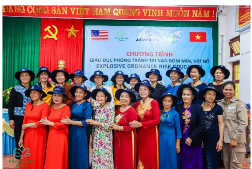
Women's Union at cooperative EORE in Quang Tri Province