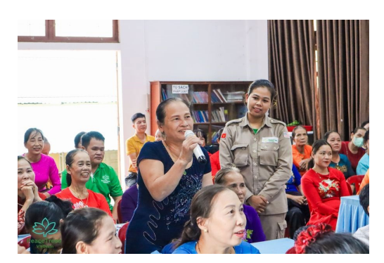
Participants and members of the Quang Tri Province Women's Union with PeaceTrees EOD technician at the cooperative EORE event

On October 12th, PeaceTrees Vietnam collaborated with the Women's Union of Quang Tri province for an Explosive Ordnance Risk Education (EORE) event, in honor of Vietnam's own Women's Day. Over 100 members of the Women's Union in Cam Hiếu commune learned about the dangers of explosive ordnance (EO) and what to do if they come across a suspected bomb. EORE events are part of PeaceTrees Vietnam's ongoing efforts to reduce EO accidents in the community. Celebrated on October 20th, Vietnam has its own Women's Day holiday in addition to International Women's Day. We extend warm wishes to all women for a meaningful Vietnamese Women's Day this year.